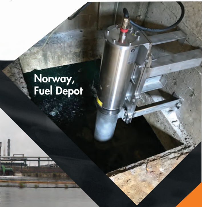
Norway, Fuel Depot