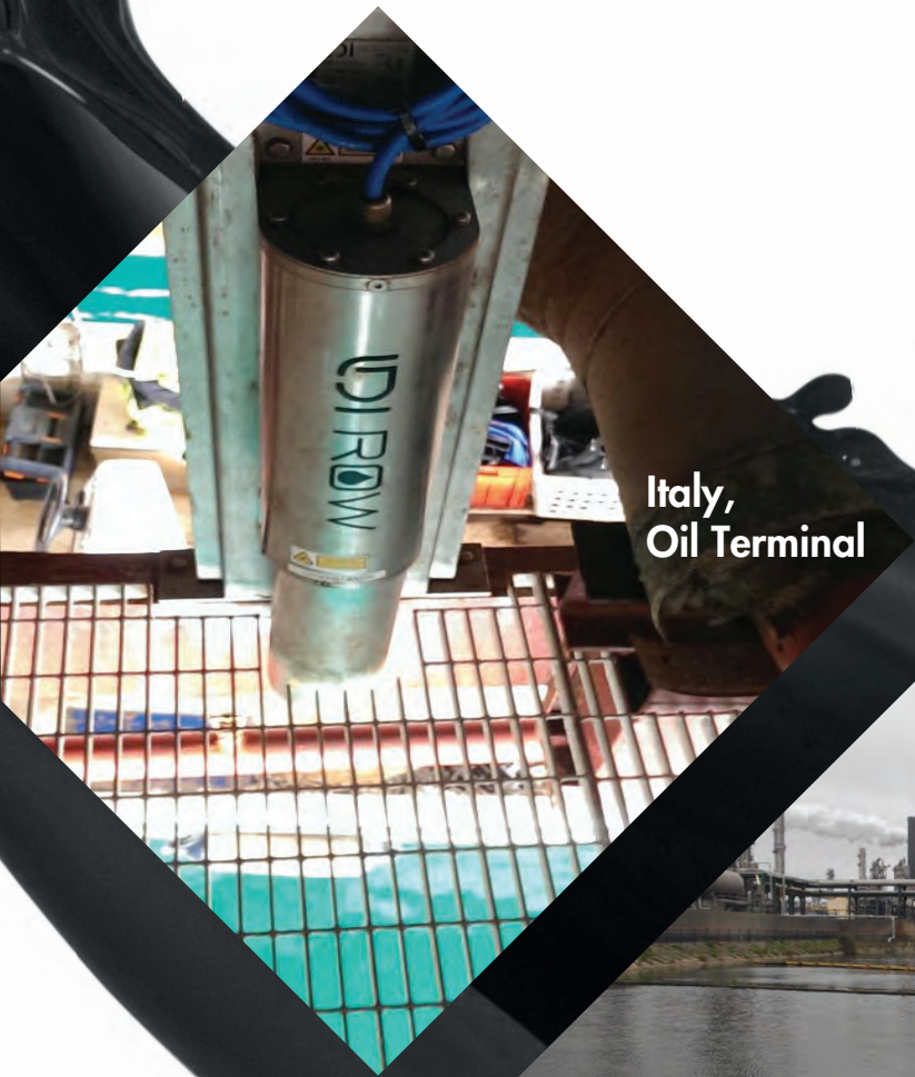
Italy, Oil Terminal

ROW Ex d Oil Detector can be installed within a network of LDI's ROW Stainless Steel and ROW Aluminium devices, making expansion of existing ROW networks exceptionally convenient.