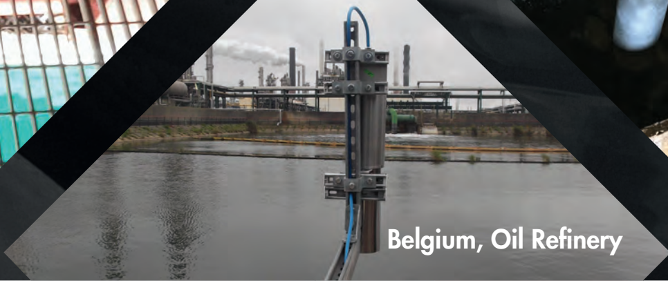
Belgium, Oil Refinery